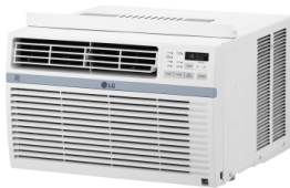
12,000 BTU Window Air Conditioner