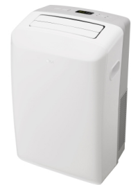
8,000 BTU Portable Air Conditioner