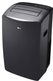
14,000 BTU Portable Air Conditioner